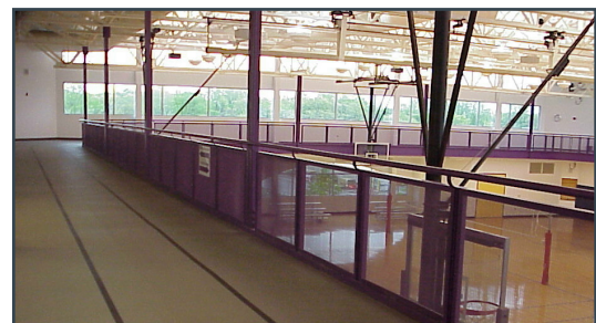
Niles Family Fitness Center walking track

This energy audit was made possible through funding provided by the Cook County Energy Conservation Block Grant program.