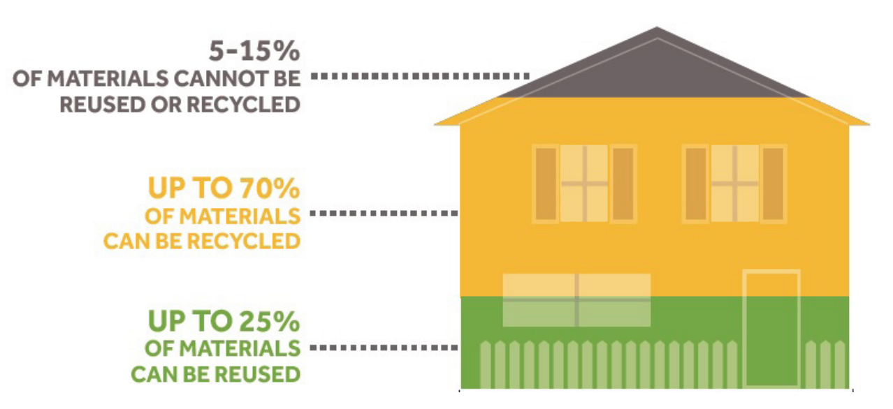
Figure 1: Many homes contain materials that have financial value in the reuse market.

Across the United States municipalities, counties, workforce development practitioners, entrepreneurs and artisans have teamed up to build the market for reclaimed materials. This document provides actionable guidance and tools for municipal managers, economic development officials and civic leaders to advance building material reuse in their community.