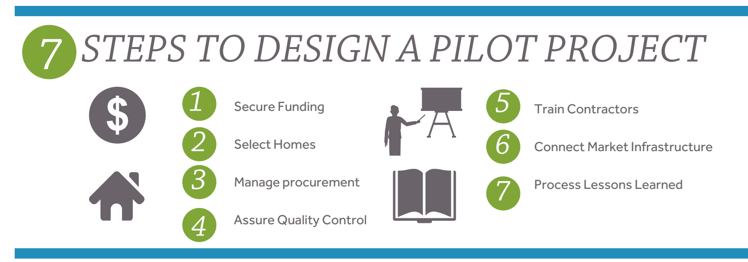
Figure 5: Pilot Project Design Steps

This module provides guidance on staging a deconstruction pilot project (Figure 5).