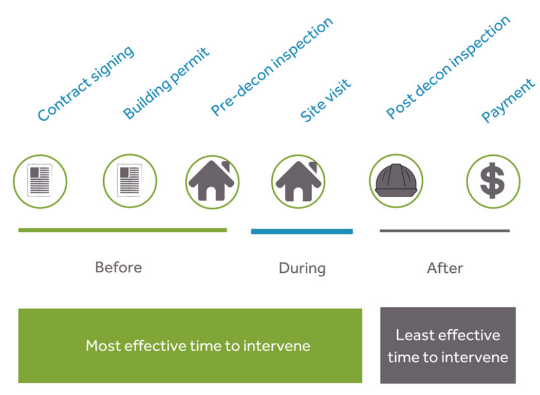
Figure 6: Quality Assurance Intervention Points

Solid project management oversight is paramount to quality assurance and quality control. It is important to create a clear process for contractors to follow that requires checks at each step of the process. This allows the project manager to identify when activities venture outside of scope and intervene accordingly. The below infographic identifies important project management milestones. The left side of Figure 6 denotes the most effective time to intervene, while the right showcases the worst time to intervene when the only recourse is not paying the contractor until work is conducted according to scope. In some cases valuable materials may be ruined and there is very little potential for a mututally beneficial outcome or project close out.