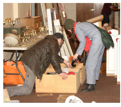
Figure 3: Many actors can participate in the reclaimed building materials marketplace.