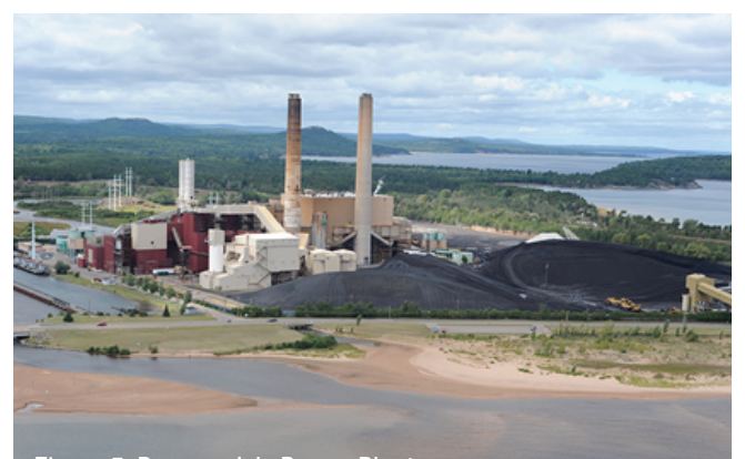
Figure 3: Presque Isle Power Plant Delta assisted the Superior Watershed Partnership and Land Trust in applying for an EDA planning grant.