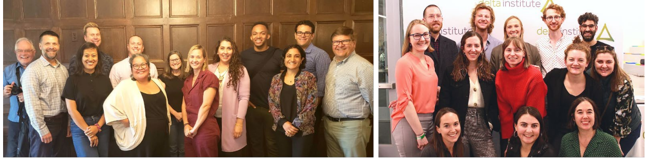
Left: Governing board of directors attend 2022 board retreat at South Shore Cultural Center in Chicago. Right: Delta Emerging Leaders at BOOST 2022 held at Ed Kaplan Family Institute for Innovation and Tech Entrepreneurship at Illinois Tech.

Acting upon the findings and recommendations of Delta's DEI Committee, we set forth to implement several new policies and activities to further advance our DEI objectives.