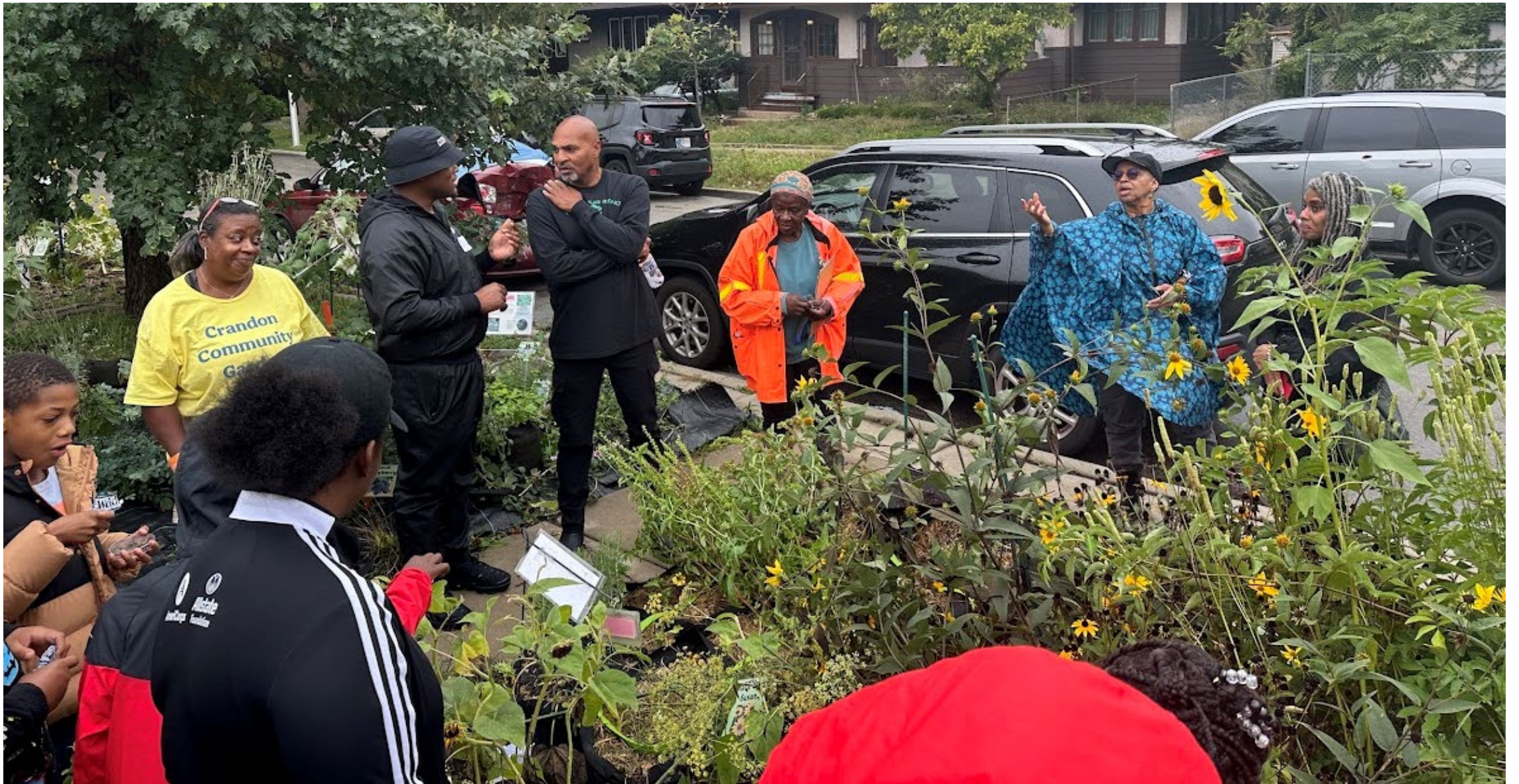
Participants of the South Shore BioBlitz on September 28 th , 2024, at the 71st and Crandon Organic Garden (2301 E 71st St, Chicago, IL 60649).